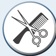
BARBER SHOPS & HAIR SALONS