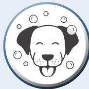
DOG WASH & PET KENNELS