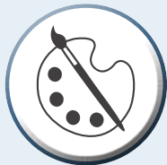
ART ROOM SINKS