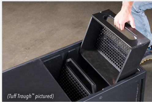
(Tuff Trough™ pictured)